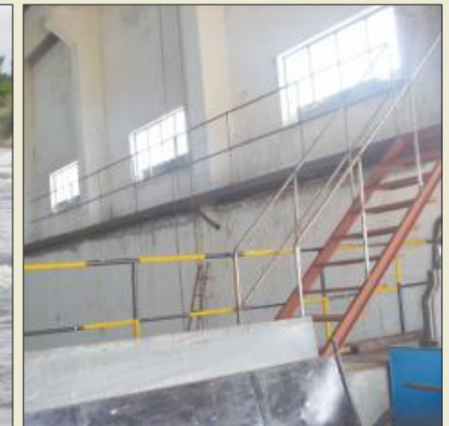
▲ The emergency exit walkway

It is not the strongest of the species that survive, nor the most intelligent, but the one most responsive to change. Charles Dickens