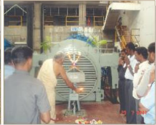
▲ Ganga Pooja - a precursor to our success

A noise-level check across the powerhouse and TG equipment premises was made as part of our annual routine work. The recorded levels are well within limits.