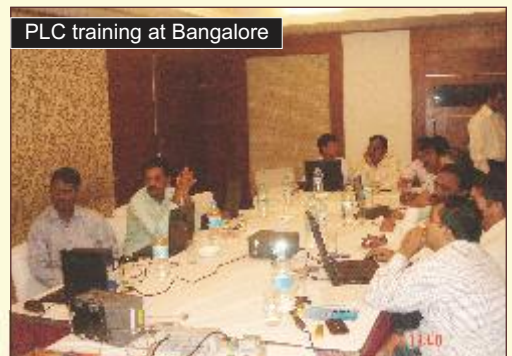
PLC training at Bangalore