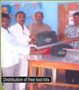
Distribution of free tool kits