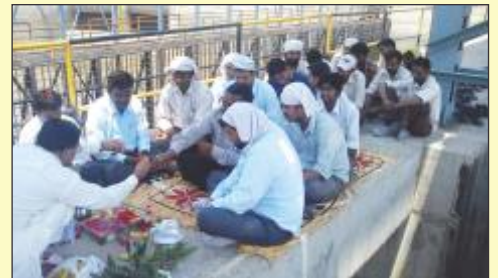
▲ Pir Baba pooja under progress