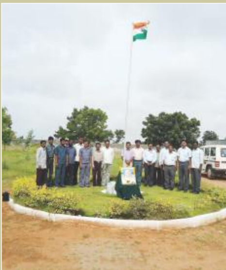
▲ Vimochana Diwas ceremony

Labour Inspector, Shorapur Circle, visited the plant site on 11th August for annual inspection. He spoke with key personal who took him around the plant. The visiting official was happy with the safety standards maintained.