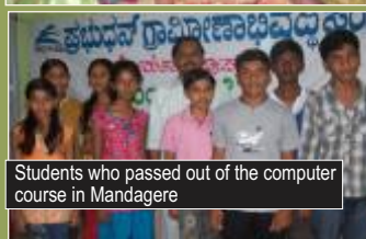
Students who passed out of the computer course in Mandagere