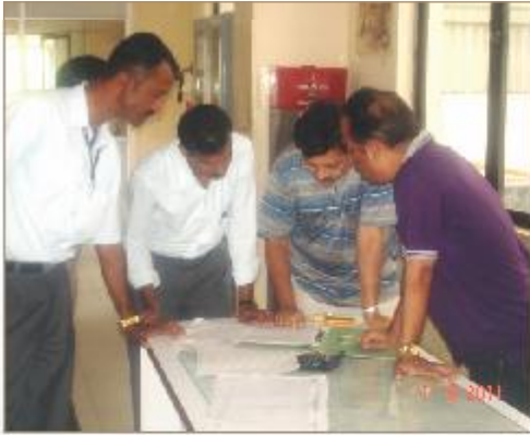
▲ The HO team visits our site