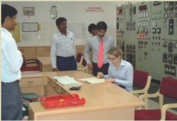
▲ CDM Audit under progress