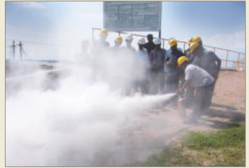
▲ Fire fighting at the mock drill was a 'real' experience for the participants