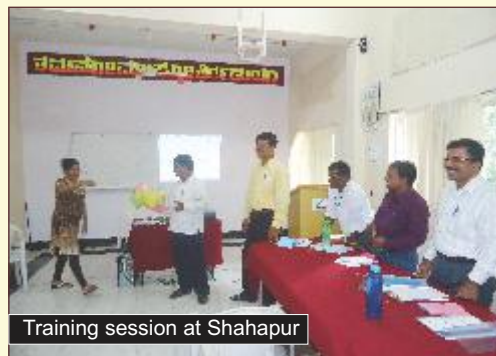
Training session at Shahapur