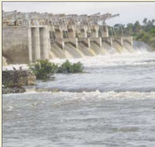
▲ Automatic gates operate during the floods