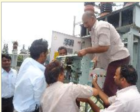
▲ Breaker operating mechanism replacement

In the Gogi sub station, D9 11KV outdoor vacuum circuit breaker operating mechanism failed and the machinery had to be run by temporarily adjusting the breaker mechanism.