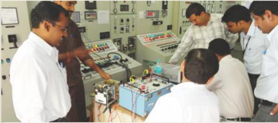
▲ Team from IIT Roorkee during the inspection