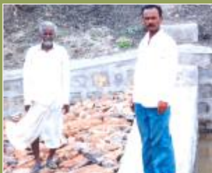
Check Dam constructed for SHG member

Bhoruka Welfare is proud to announce that the circulation of Micro Finance assistance is touching the Rupee One Crore Mark!