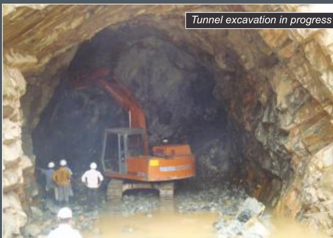
Tunnel excavation in progress

The Kumaradhara plant site is moving at an amazing pace as the engineers work tirelessly on the long list of chores to be completed before commissioning.