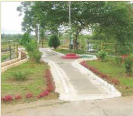
▲ Garden landscaping is a visitor's joy