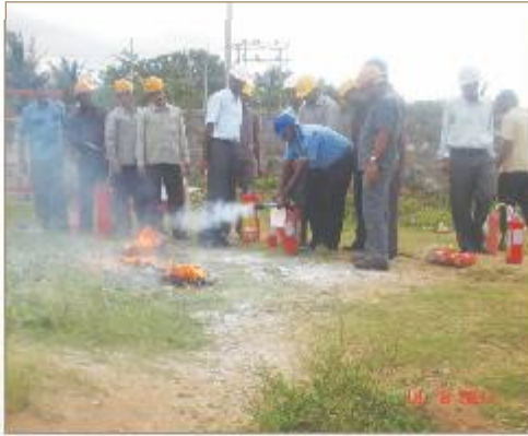
▲ Employees participating in the mock drill

A 2-member team from the Head Office comprising General Manager (Technical) and Deputy General Manager (Operations) paid a visit to our plant site. During talks with our team, they made valuable suggestions for re-stringing the 11 KV double circuit transmission line across the river crossing towers which would improve ground clearance and other O&M issues.