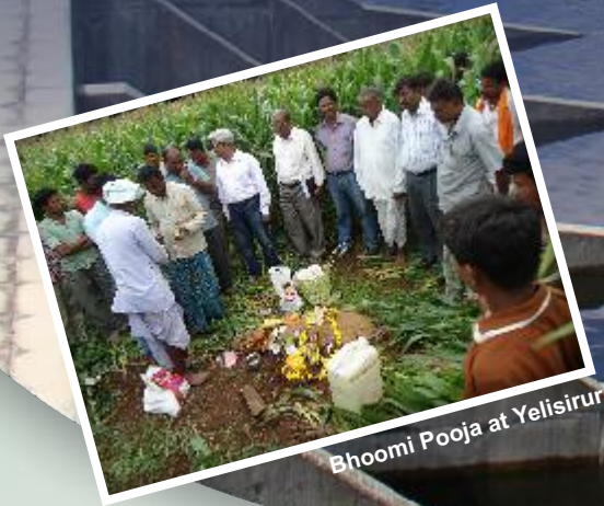
Bhoomi Pooja at Yelisirur