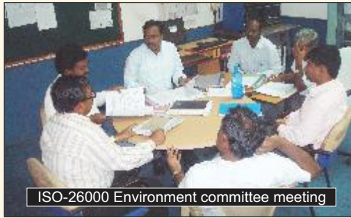
ISO-26000 Environment committee meeting