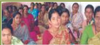
Women participate in the health check up