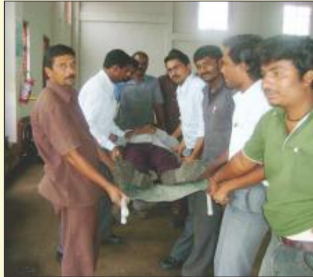
▲ Participants have a great day at the mock drill

In our concerted effort to increase the greenery around the powerhouse premises, 'Buffalo Grass' was laid across the garden giving it a fresh, new look. The grass which is grown in the neighbouring villages is thick and lush green.