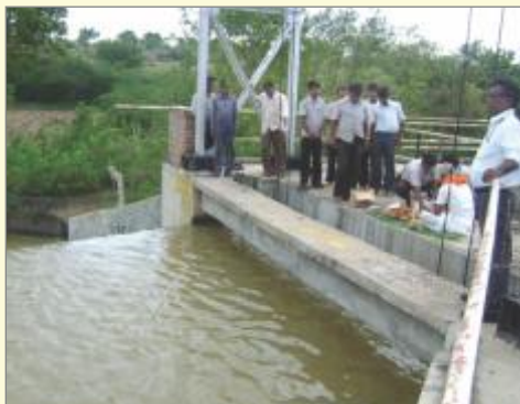
▲ Ganga Pooja is a solemn occasion before canal opens

The machines were started with a formal Ganga Pooja after canal closure work was completed successfully.