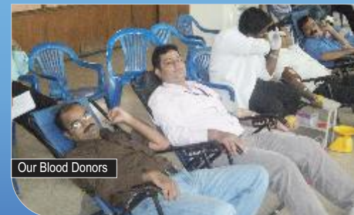
Our Blood Donors