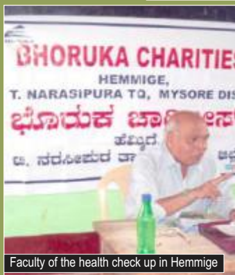
Faculty of the health check up in Hemmige